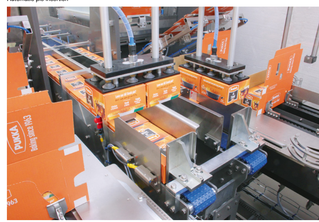
Dual 'back to back' pick and place robots